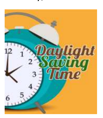
Sunday, March 8th